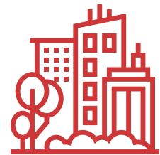
Urban Development and Environment Management