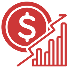
Economic Development and Reform

Students can choose one of the following concentrations prior to admission.