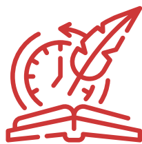
History and Culture